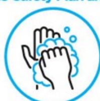
Hygiene and cleaning