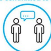
Wellbeing of staff and customers