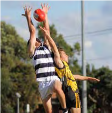
Werribee Districts and Albion went head-to-head at the weekend.

Round 5's fixture has Newport Power up against Sanctuary Lakes at Bryan Martyn Oval and Wyndhamvale face Werribee Districts at Soldiers Reserve.