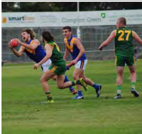
Deer Park got some revenge on Spotswood after their Round 1 defeat, with victory at the weekend.