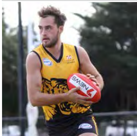
Werribee Districts claim its third win of the season after defeating Albion.