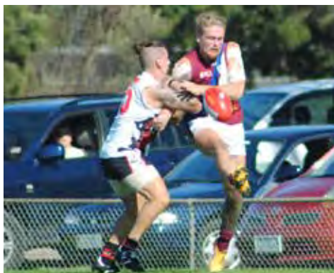
Tarneit proved too strong for North Sunshine.