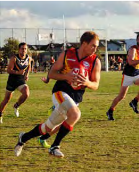
Caroline Springs and Yarraville Seddon Eagles fought-out a thrilling Round 4 match at Town Centre Oval.

Led by Sam Kater who kicked a bag of 10, the Devils ran away with it in the third kicking another seven goals to the Roosters one to blow the margin out to 129-points. Though the margin was set up in the last as the Devils showed no mercy kicking an astonishing 37.26 for the game to run out 225-point victors.