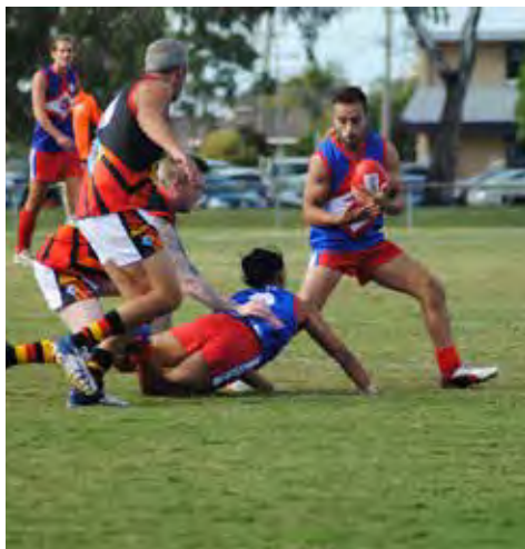
Sunshine Heights fought off a talented Wyndham Suns line-up on Saturday.