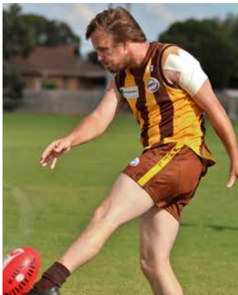
Glen Orden scored its first win of the 2016 season after defeating Albanvale.

Glen Orden are set to take on West Footscray at Shorten Reserve while Yarraville have the bye.