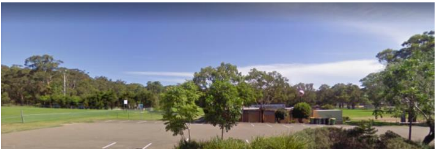
CROUDACE BAY COMPLEX