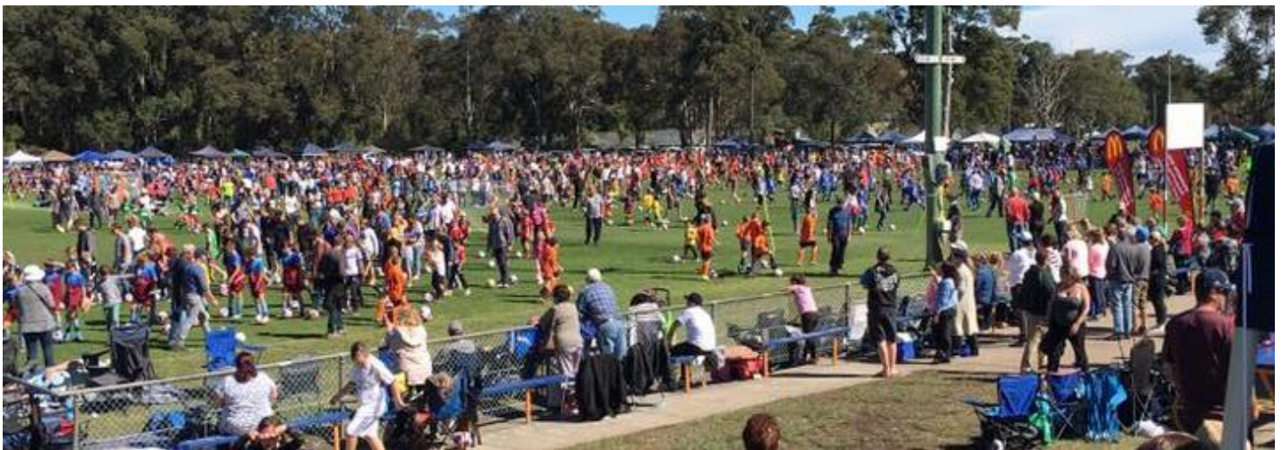
ANNUAL GALA DAY