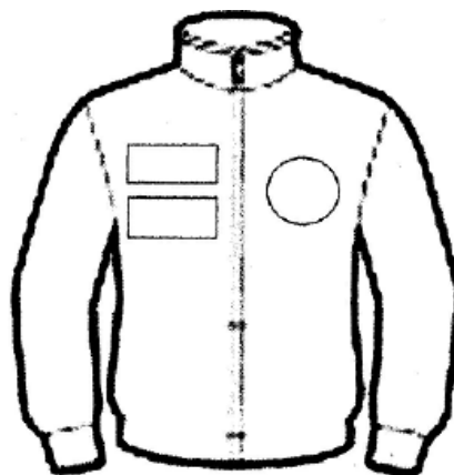
FRONT OF JACKET (Right Hand Side)