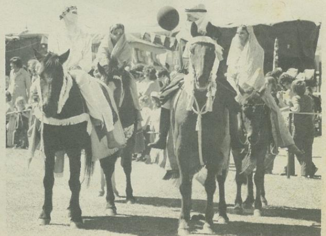
BELOW LEFT: The Lions Club merry-go-round kept the youngsters amused.