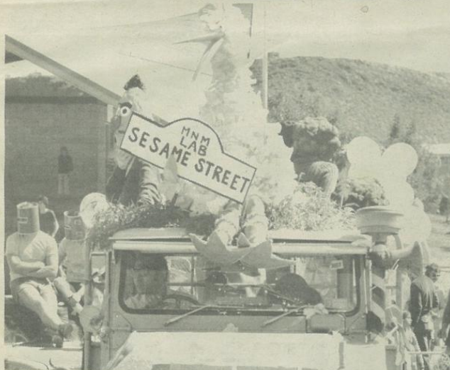
BELOW: The winning float in the Festival Parade — entered by MNM Laboratory.