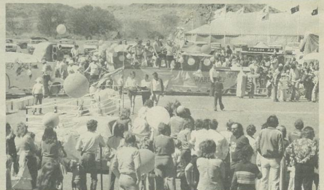
ABOVE: The scene on the Capricorn Oval as the Fancy Dress Parade circles the arena.