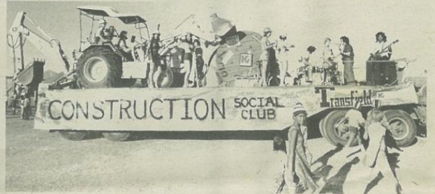
BELOW: The Construction Social Club float — complete with pop group, 'Black Rock' and glamorous girls in hot pants, and glitter!