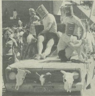
ABOVE: Kelly's Gang.