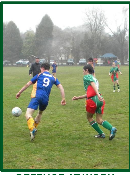
DEFENCE AT WORK