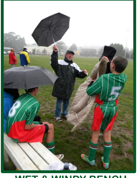
WET & WINDY BENCH