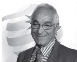
Fair Play Award, Adelaide City