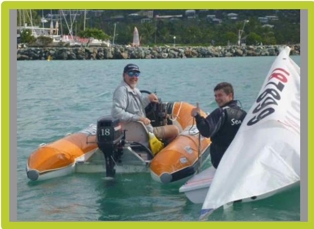
Laser sailors from Cairns to Bundaberg attended the camp to learn some laser specifics