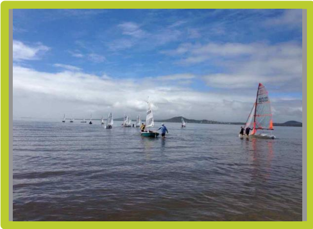
Heading out on the water after an overnight storm & flood in Bowen