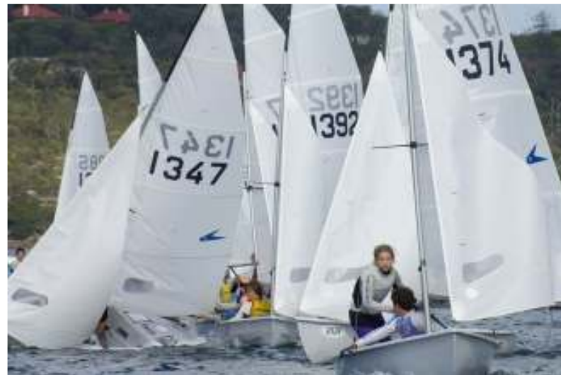
'F11s Hungry For Action' David Price Click Here to view large photo

Hungry for a big gulp of some close-up sailing this weekend? Forget the TV, this is live and it's right in front of you from the shores of the upper harbour in Sydney.