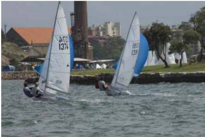
Close-Up Viewing From Clarkes Point - David Price Click Here to view large photo

The second race of the championships on Saturday is scheduled to start mid-afternoon with the F11 fleet also mixing it up with the first heat of the NSW 12ft Skiff Championships hosted by Lane Cove 12ftSSC starting in the Lane Cove River at 1445hrs.