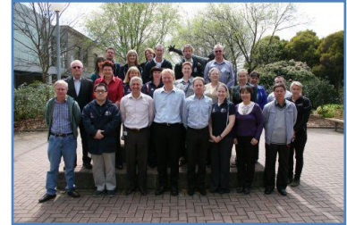
OSIC Coordinator with other AUSPIN Attendees