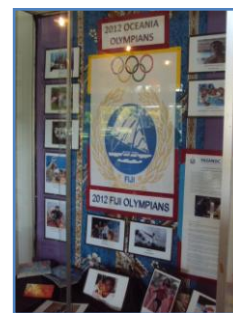
2012 Oceania Olympians